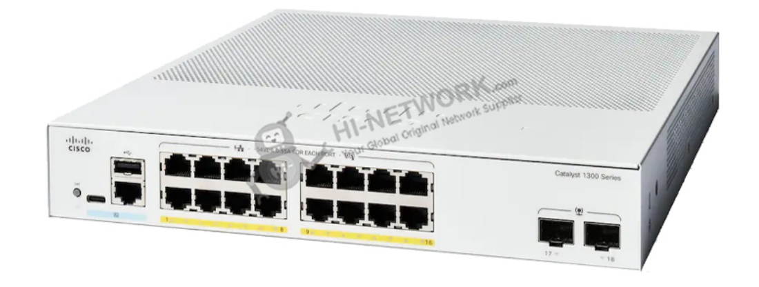
Figure 1 shows the appearance of C1300-16FP-2G.