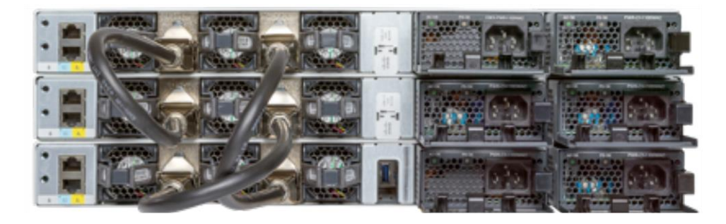
Figure 6. Cisco Catalyst 9300 Series fixed uplink models with optional stack kit