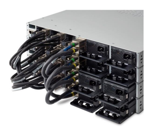
Figure 7. Cisco Catalyst 9300 Series StackPower