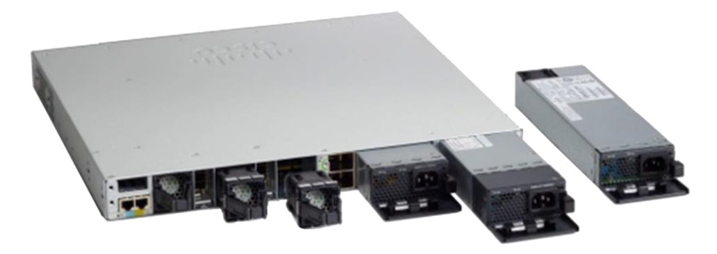
Figure 4. Cisco Catalyst 9300 Series Dual Redundant power supplies

Cisco Catalyst 9300 Series switches support dual redundant power supplies. The switches ship with one power supply by default, and the second power supply can be purchased when the switch is ordered or at a later time. If only one power supply is installed, it should always be in power supply bay #1. The switches also ship with three field-replaceable fans. Power Supplies are common across the Catalyst 9300 Series.