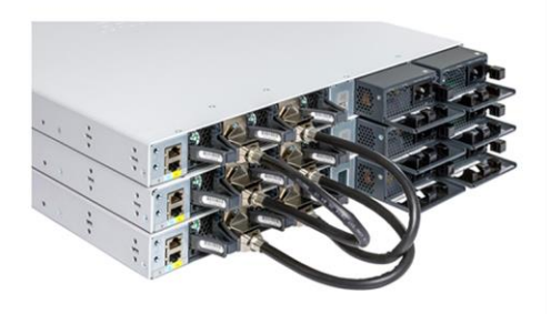
Figure 5. Cisco Catalyst 9300 Series modular uplink models stack (C9300/C9300X SKUs) and fixed uplink models stack (C9300L SKUs)

Table 5 lists the supported stacking options.