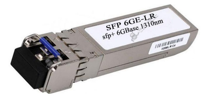
Figure 1 shows the appearance.