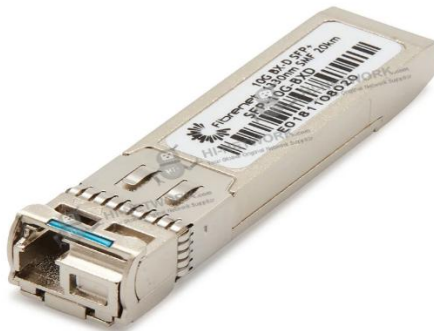
Figure 1 shows the appearance.