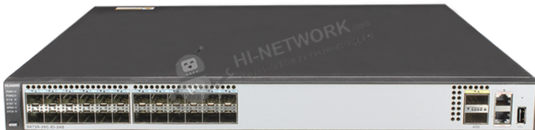
Figure 1 shows the appearance of S6720-30C-EI-24S-AC.