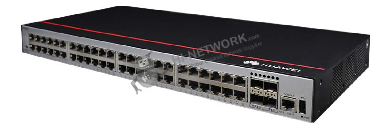
Figure 1 shows the appearance of S5735S-L48P4S-A1.