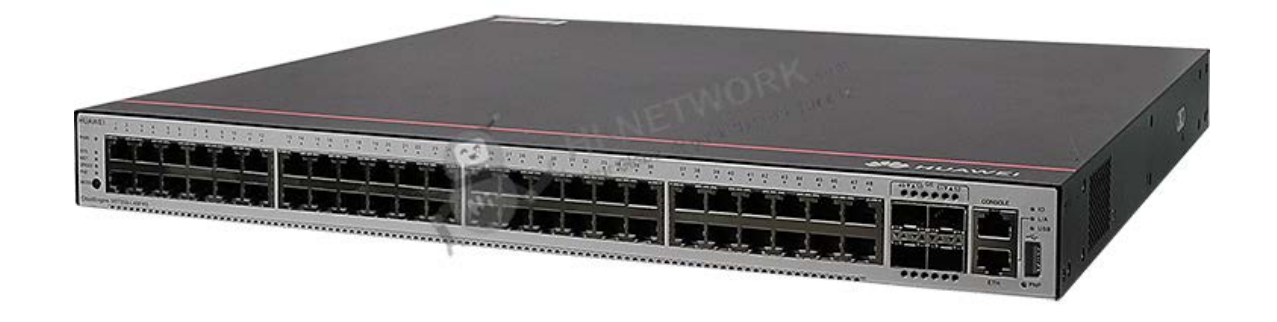
Figure 1 shows the appearance of S5735S-L48P4S-A.