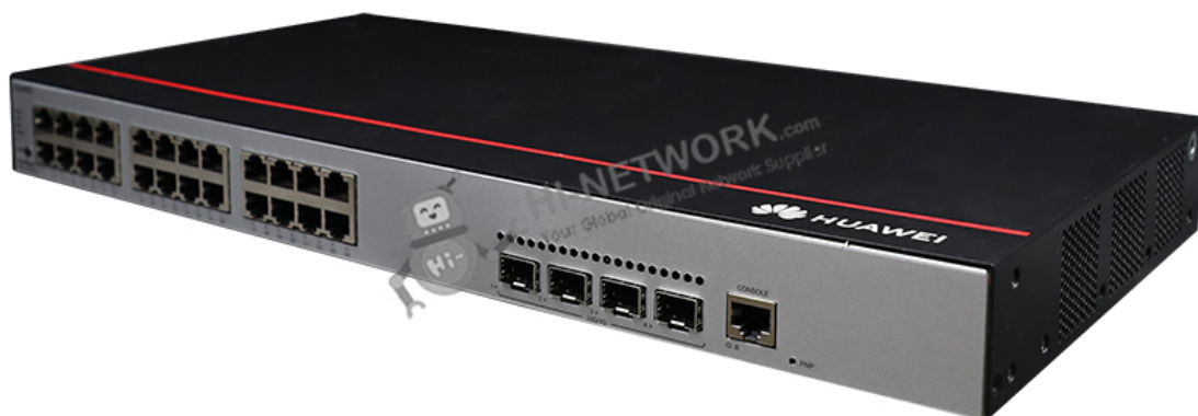
Figure 1 shows the appearance of S5735S-L24T4X-A1.