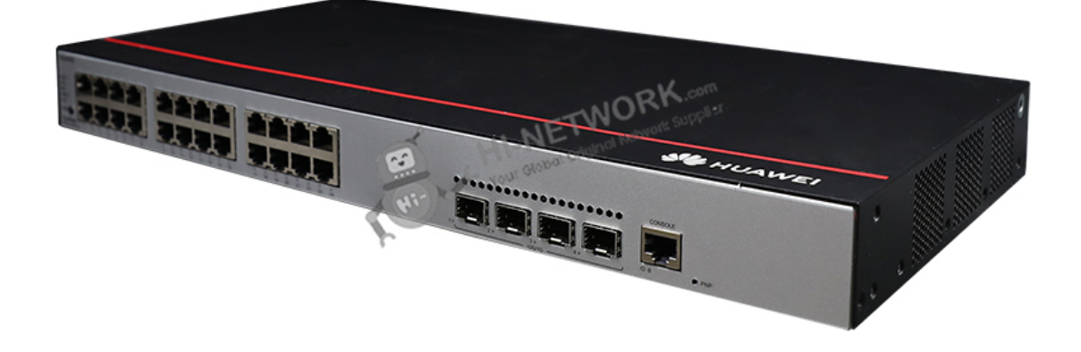
Figure 1 shows the appearance of S5735S-L24P4X-A1.