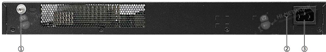
Figure 3 shows the back view of S5735S-L24FT4S-A.