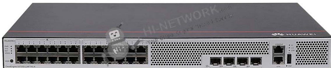
Figure 1 shows the appearance of S5735S-L24FT4S-A.