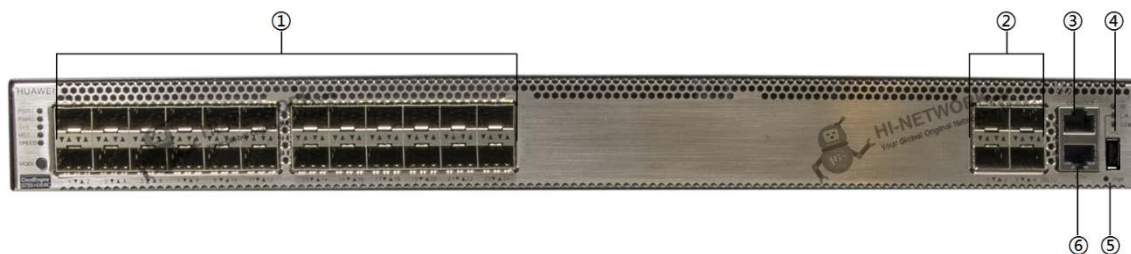
Figure 2 shows the front ports of S5735S-H24S4XC-A.