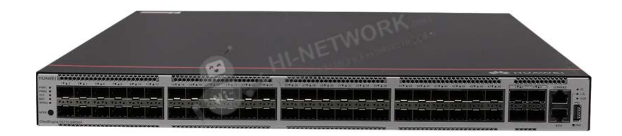
Figure 1 shows the appearance of S5735-S48S4X.