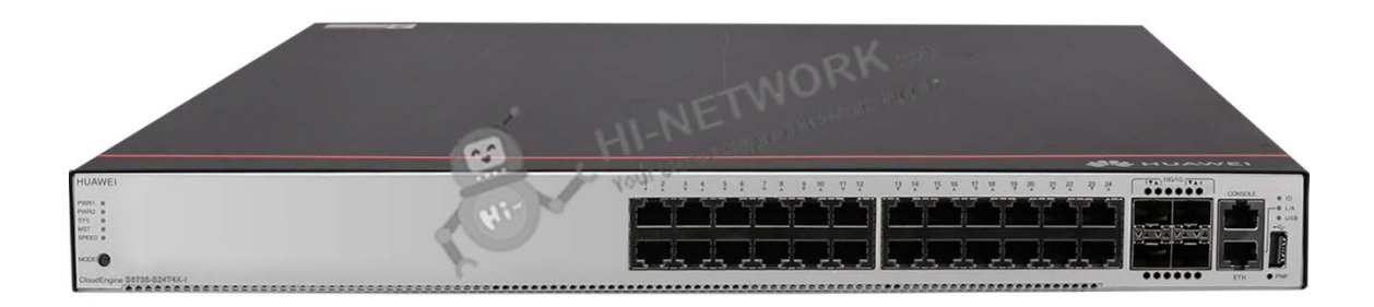
Figure 1 shows the appearance of S5735-S24T4X-I.