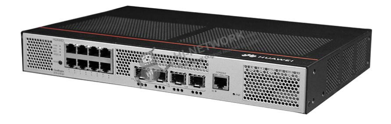
Figure 1 shows the appearance of S5735-L8T4S-QA1.