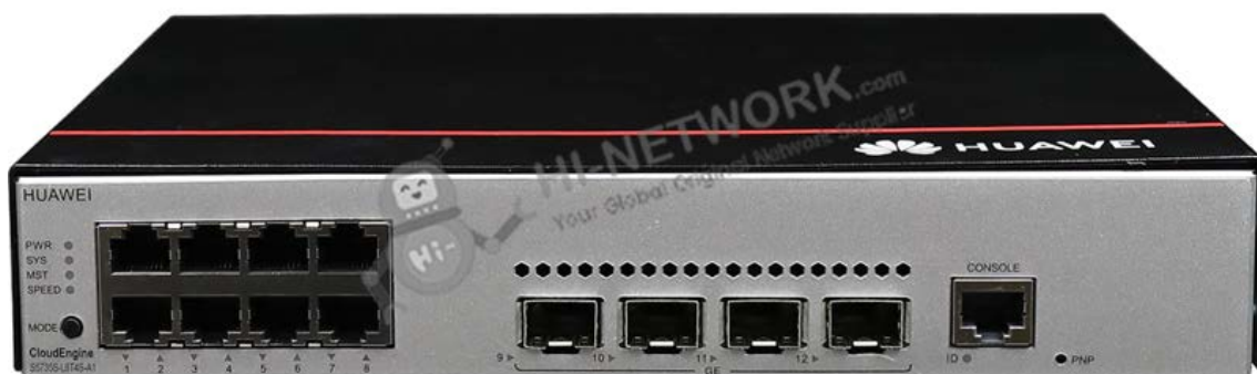
Figure 1 shows the appearance of S5735S-L8T4S-A1.