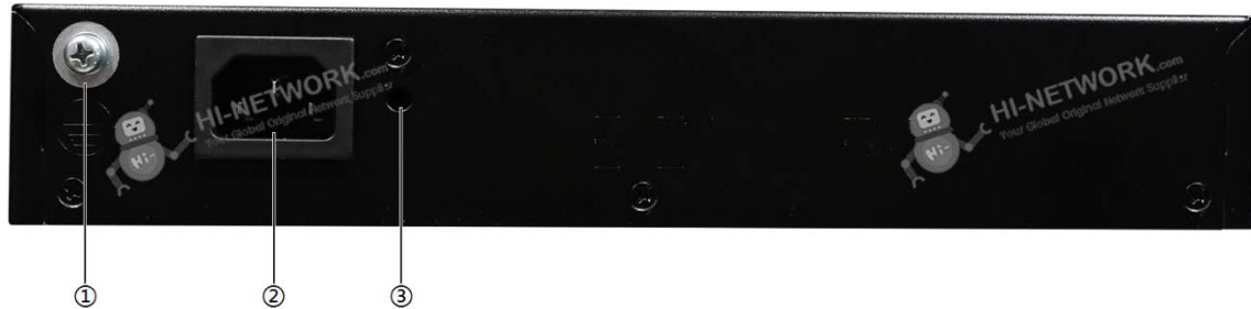
Figure 3 shows the back view of S5735S-L8T4S-A1.