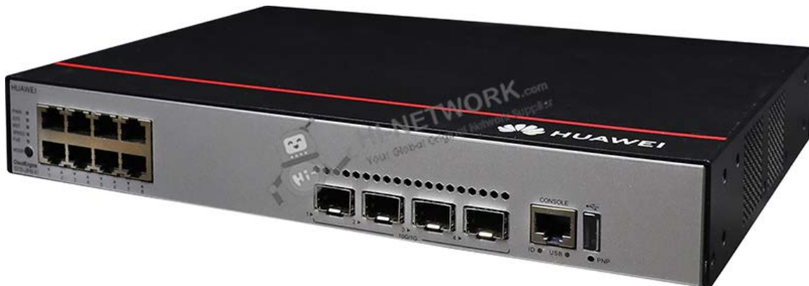
Figure 1 shows the appearance of S5735-L8P4X-A1.