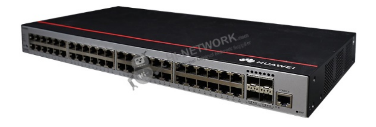
Figure 1 shows the appearance of S5735S-L48T4S-A1.