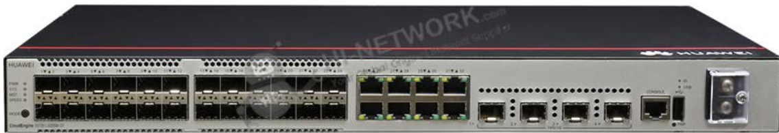
Figure 1 shows the appearance of S5735-L32ST4X-D1.