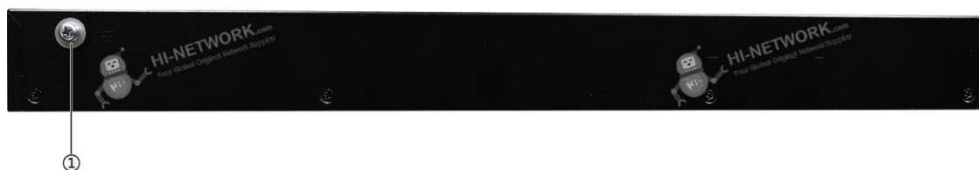
Figure 3 shows the back view of S5735-L32ST4X-D1.