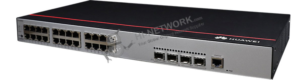
Figure 1 shows the appearance of S5735S-L24T4S-A1.