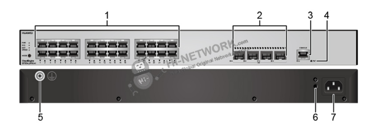
Figure 2 shows the structure of S5735S-L24T4S-A1.