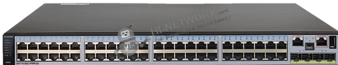
Figure 1 shows the appearance of S5710-52C-PWR-EI-AC.