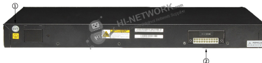
Figure 3 shows the back panel of S5701-28X-LI-AC.

* The AC terminal locking latch is not delivered with the switch.