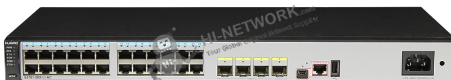
Figure 1 shows the appearance of S5701-28X-LI-AC.