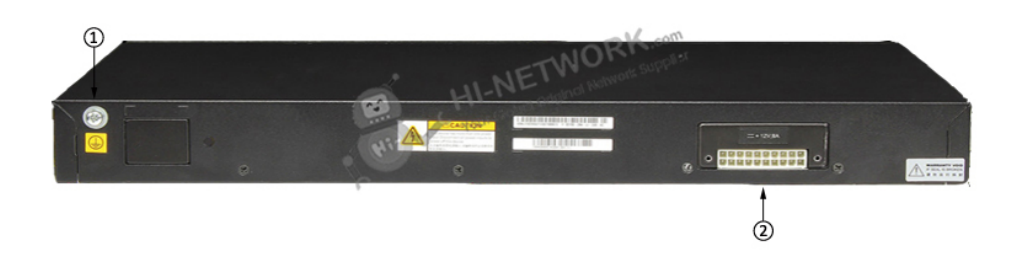
Figure 3 shows the back panel of S5701-28X-LI-24S-AC.