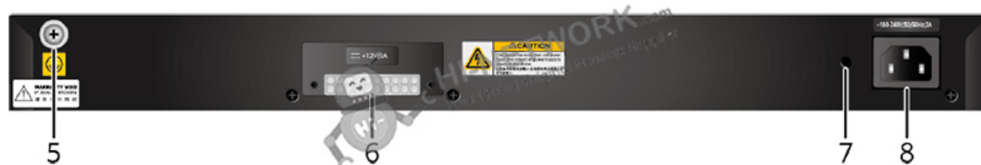
Figure 3 shows the back panel of S5700S-52P-LI-AC.