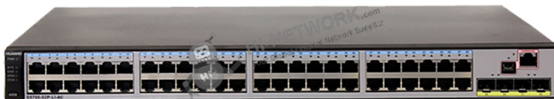
Figure 1 shows the appearance of S5700S-52P-LI-AC.