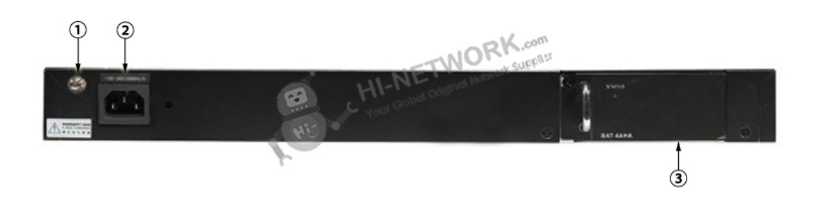
Figure 2 shows the front panel of S5700-28P-LI-24S-BAT.