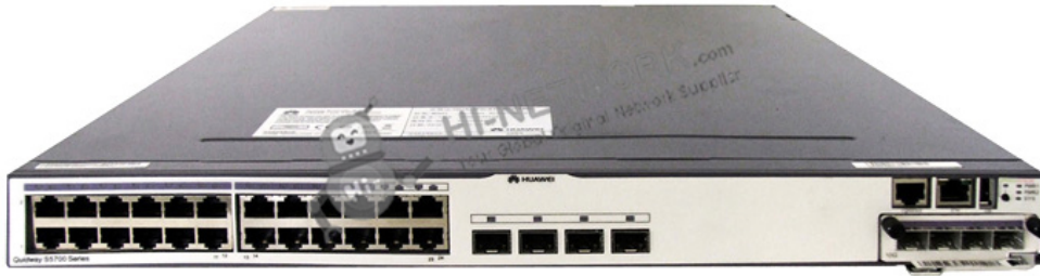
Figure 1 shows the appearance of S5700-28C-PWR-SI.