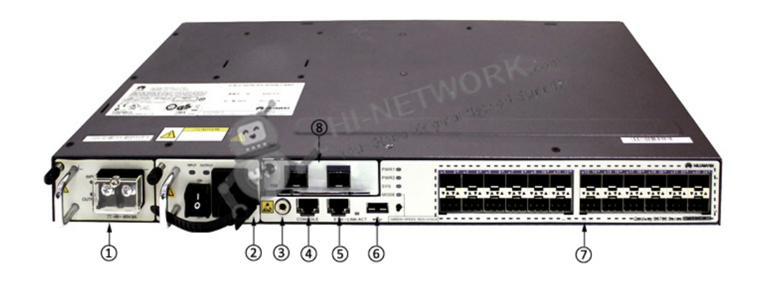
Figure 2 shows the front panel of S5700-28C-HI-24S.