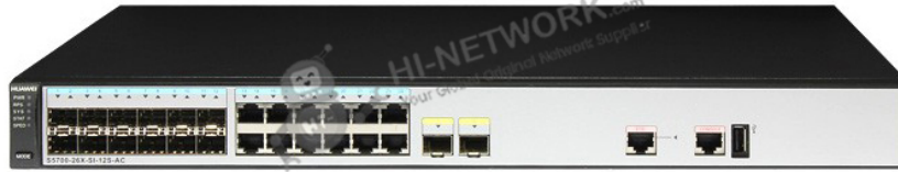
Figure 1 shows the appearance of S5700-26X-SI-12S-AC.