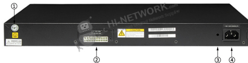
Figure 3 shows the back panel of S5700-26X-SI-12S-AC.