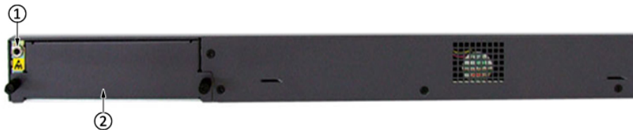
Figure 3 shows the back panel of S5700-24TP-SI-AC.