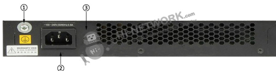
Figure 3 shows the back panel of S5700-10P-PWR-LI-AC.