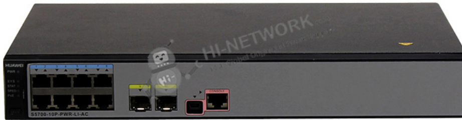
Figure 1 shows the appearance of S5700-10P-PWR-LI-AC.