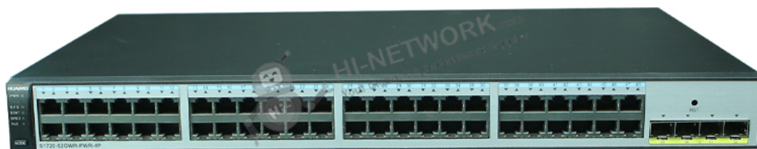
Figure 1 shows the appearance of S1720-52GWR-PWR-4P.