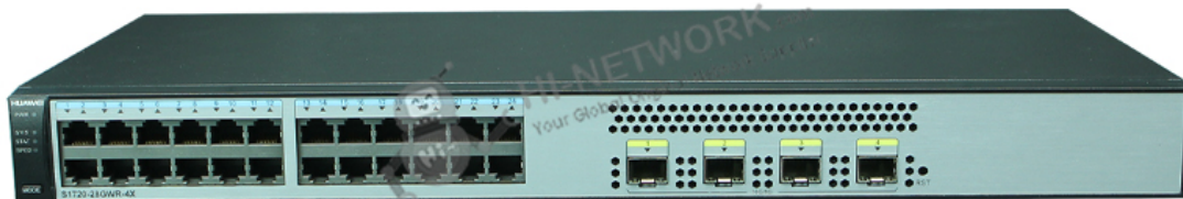
Figure 1 shows the appearance of S1720-28GWR-4X.