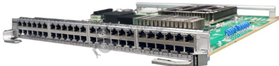
Figure 1 shows the appearance of LSS7M24BX6E0.