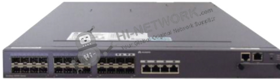
Figure 1 shows the appearance of LS-S5328C-EI-24S.