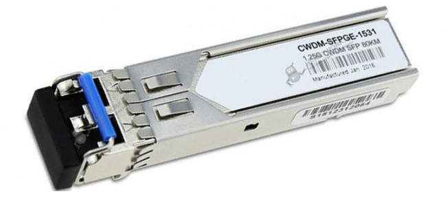
Figure 1 shows the appearance.