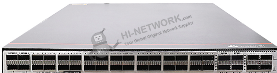
Figure 1 shows the appearance of CE8851-32CQ8DQ-PB.