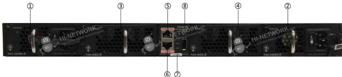
Figure 3 shows the rear (power supply side) panel of CE6855-48S6Q-HI.