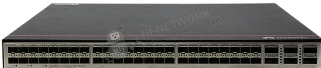
Figure 1 shows the appearance of CE6820-48S6CQ-F.