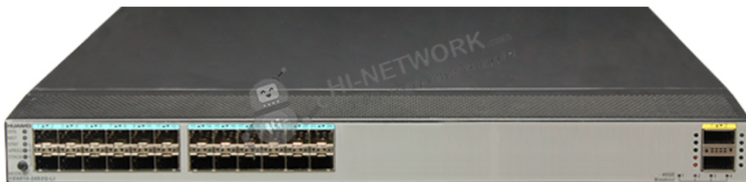
Figure 1 shows the appearance of CE6810-LI-B-B0C.