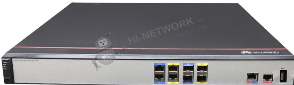
Figure 1 shows the appearance of AR6140E-9G-2AC.