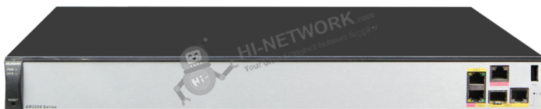
Figure 1 shows the appearance of AR2204E.