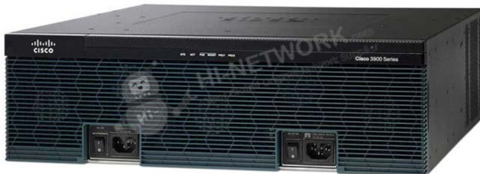
Figure 1 shows the appearance of the Cisco 3925 router for reference.