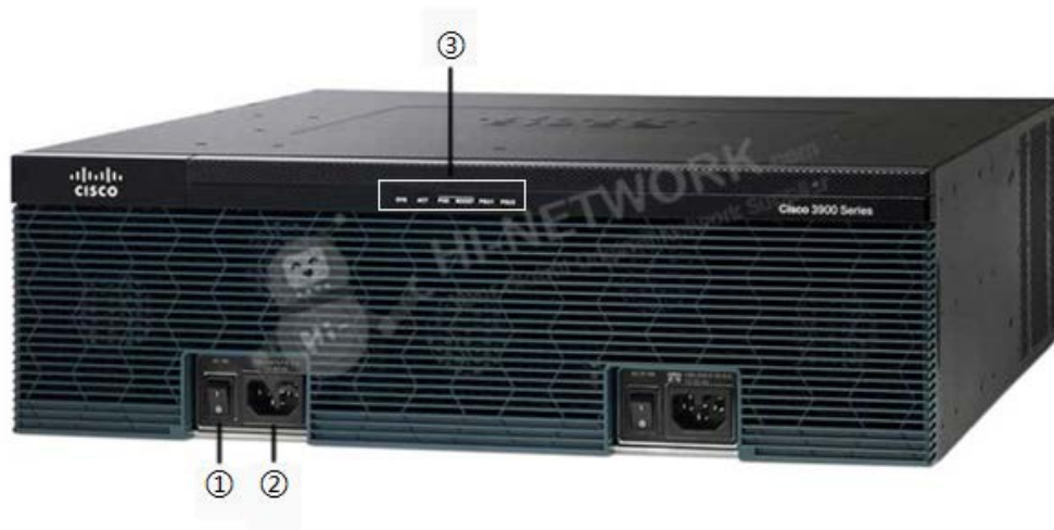
Figure 2 shows the front panel of the Cisco 3925 router.