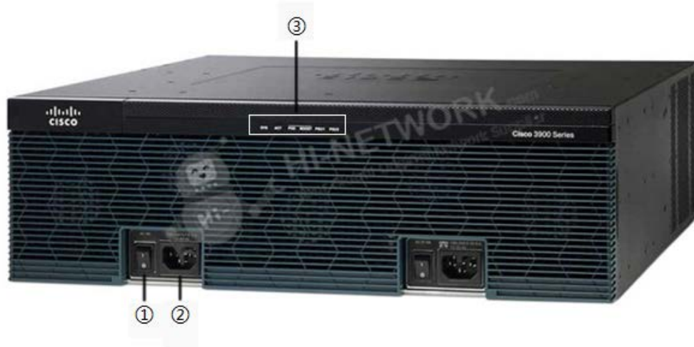
Figure 2 shows the front panel of the Cisco 3925 router.