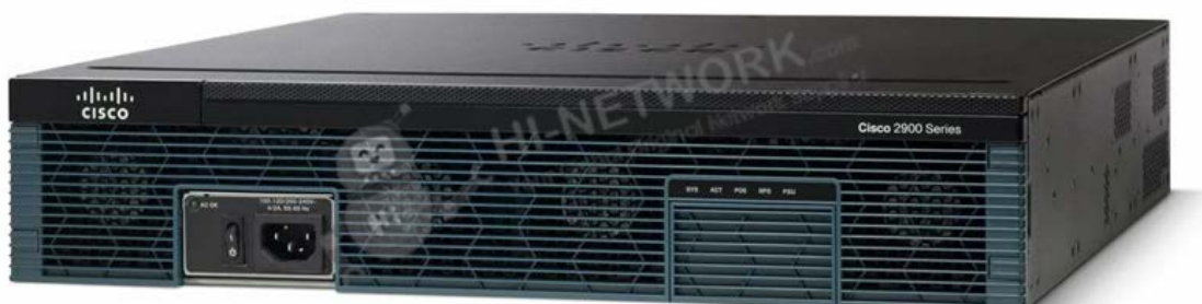
Figure 1 shows the appearance of the Cisco 2951 Router.