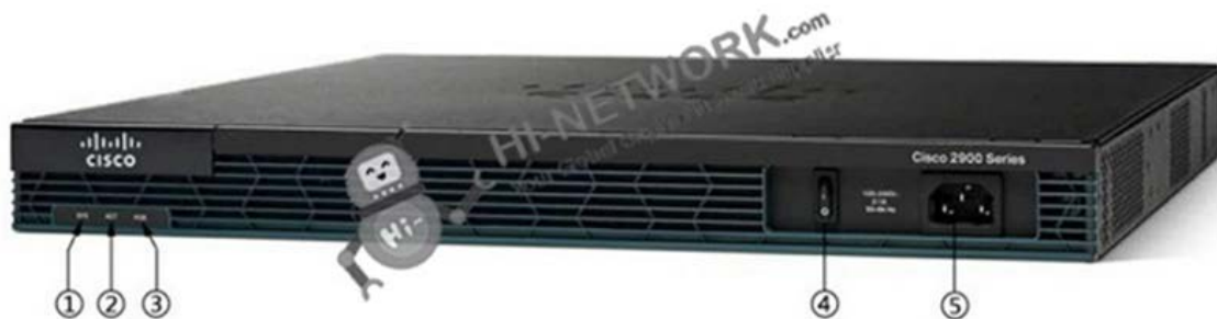
Figure 2 shows the front panel of the Cisco 2901 router with ports and LEDs.