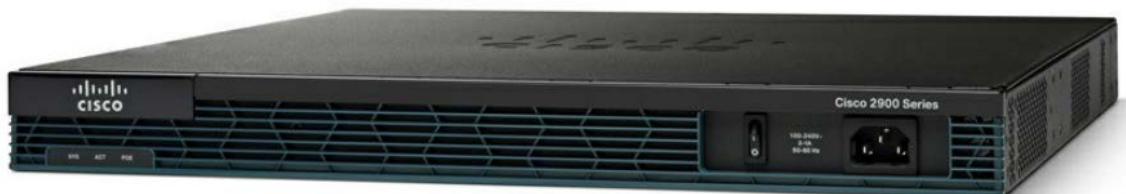
Figure 1 shows the appearance of the CISCO2901-V/k9.