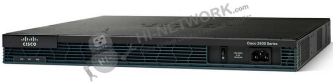
Figure 1 shows the front view of CISCO2901-SEC/K9.