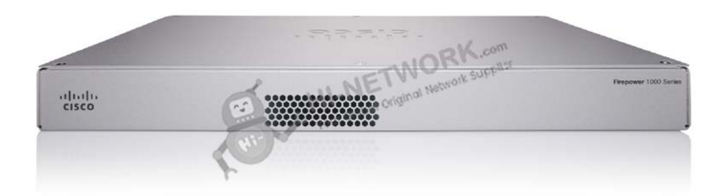
Figure 1 shows the appearance of the Cisco Firepower 1000 Series.