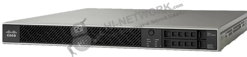
Figure 1 shows the appearance of ASA5555-K9.