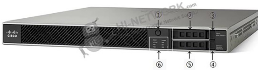
Figure 2 shows the front panel.