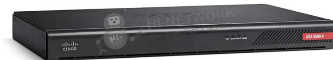
Figure 1 shows the appearance of ASA5508-K9.