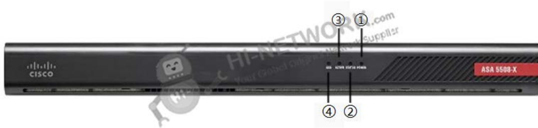
Table 2 shows the description of Status LED on the front panel.