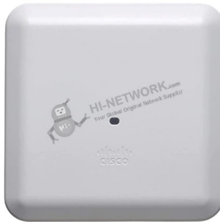
Figure 1 shows the appearance of the AIR-AP2802I-H-K9-RF.