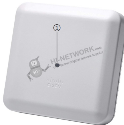
Figure 1 shows the face of AIR-AP2802I Model.