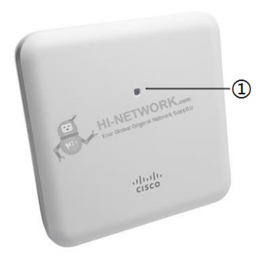
Figure 2 shows the AIR-AP1852I LED Indicator Position.